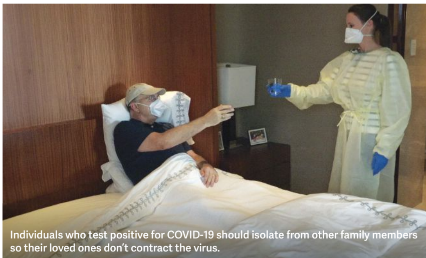
Individuals who test positive for COVID-19 should isolate from other family members so their loved ones don't contract the virus.

3. Ability: Resilience skills include audits of the service, supplies, and